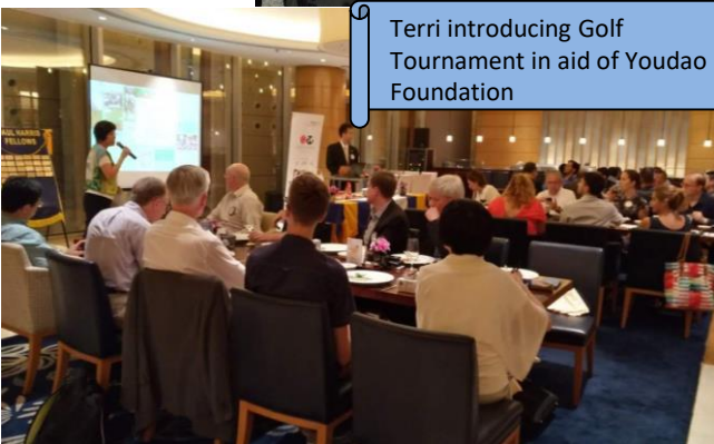
Terri introducing Golf Tournament in aid of Youdao Foundation